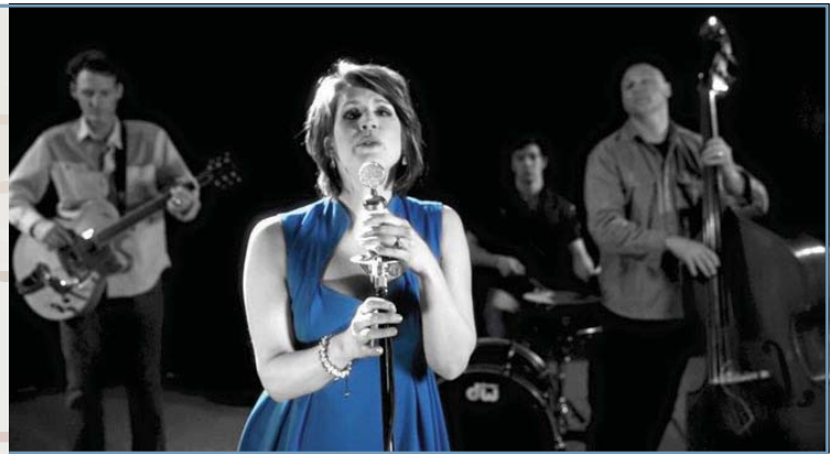
Thursday Headliner: multiple CCMA winner LISA BROKOP!