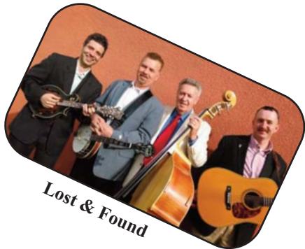
Lost & Found

Island bands will be added in due course according to availability.