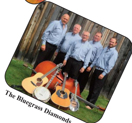
The Bluegrass Diamonds